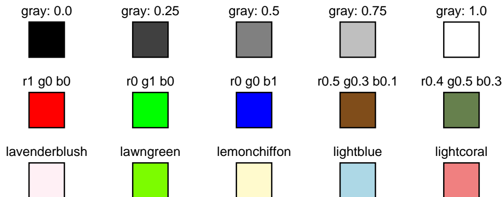
Figure 2-7: RGB Color Models

canvas.drawCentredString(x+dx/2, y+texty, "r%s g%s b%s"%rgb) x = x+dx y = y + dy; x = 0 for gray in (0.0, 0.25, 0.50, 0.75, 1.0): canvas.setFillGray(gray) canvas.rect(x+rdx, y+rdy, w, h, fill=1) canvas.setFillColor(black) canvas.drawCentredString(x+dx/2, y+texty, "gray: %s"%gray) x = x+dx